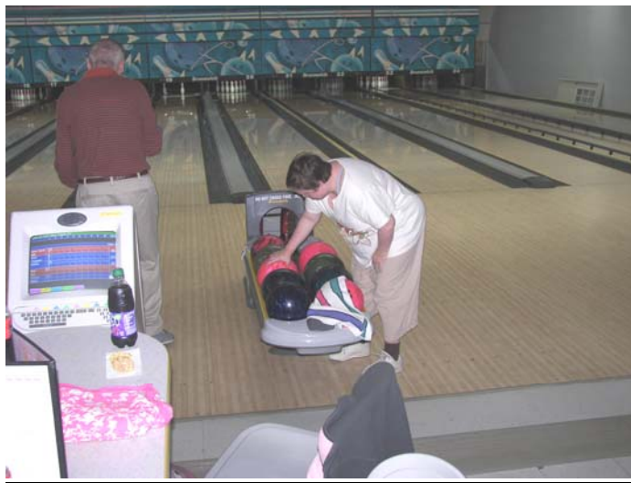
Bowling Team at practice.

Spalding County Parks and Recreation pursued and initiated the addition of a Special Olympics program for adults. Throughout the year the Bowling team practices for many weeks in preparation to compete at the Special Olympics Masters State Bowling Tournament each year.