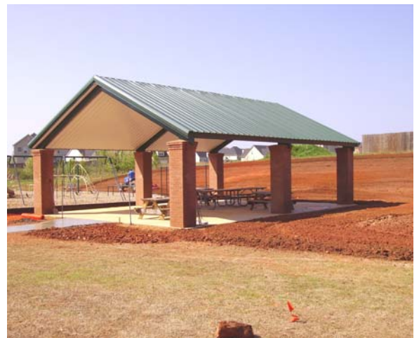
The new Pavilion and picnic shelter at Moreland Road School

Ribbon cutting ceremonies at Moreland Road School was attended by Spalding County Commissioners, Advisory Commission members, and staff.