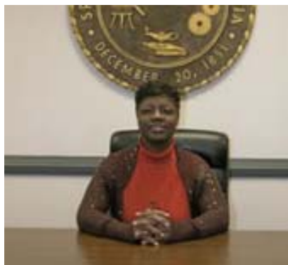
Commissioner Gwen Flowers-Taylor