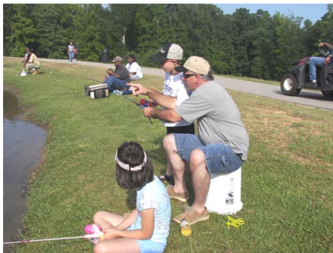
Kids Fishing Day at Tyus Park