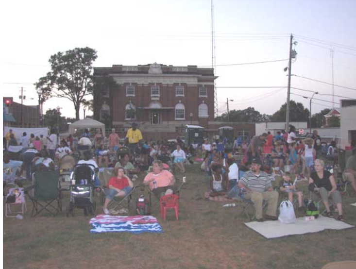
“Movies in the Park” night in Downtown Griffin