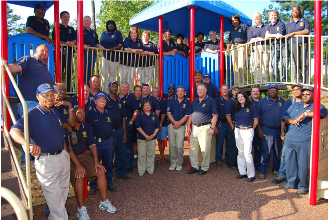
Parks and Recreation Staff 2008/2009